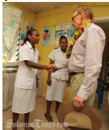
Australian Foreign Minister, Bob Carr meets with local nurses at Tulagi Hospital

Australia will aim for the long-term elimination of malaria in the Solomon Islands, starting with delivery of an additional $14.75 million over four years.