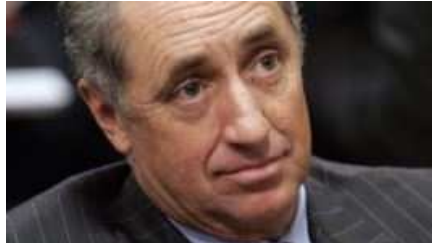
American sports writer Rick Reilly

The Nothing But Nets campaign was started after American sports journalist Rick Reilly challenged his readers to donate at least $10 to help purchase bed nets. Now, the group raises millions of dollars from hundreds of thousands of people worldwide.