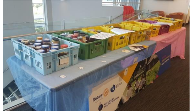
Bill Oakley's RAM JAMs - $700 raised for RAM!!