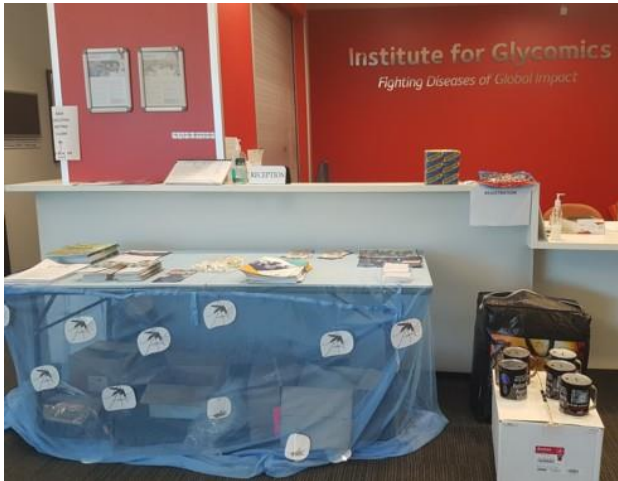
Conference reception and hand-outs.