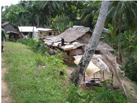
Part of White River settlement White

I travelled to White River, a low-cost housing settlement on the edge of town, and witnessed one of the clean-up teams checking watercourses and stagnant water areas and applying “Abate”. I was impressed; they were doing a very thorough job.