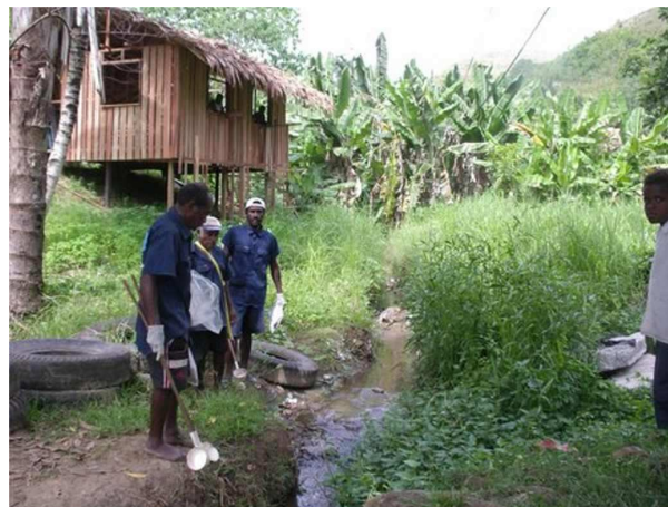
Testing for mosquito larvae, White River settlement

This work is an integral part of the overall malaria control program in the urban area. The use of treated bednets, the spraying of residual insecticide in all dwellings, good treatment protocols and reduction of mosquito breeding areas, has seen a dramatic reduction in the Incident Rate for Honiara Urban Area to 82/1000. Funding from The Global Fund, AusAID, The Rotary Foundation (our 3H Grant) and RAM have all contributed to this outstanding achievement.